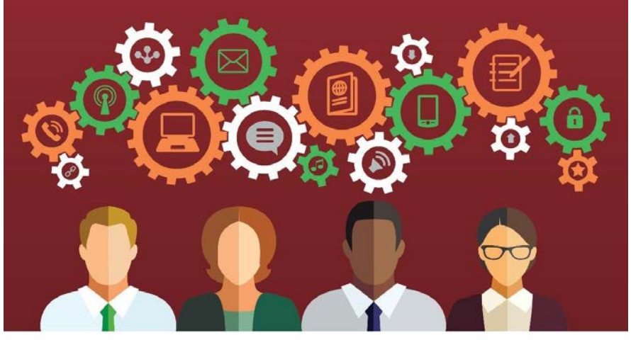
"The administrations recognise the importance of co-operation across a range of areas." (Memorandum of Understanding)

Having clarified territorial extent, you will then need to understand implications for your policy on parts of the UK where the policy does not directly apply and whether communication or coordination with other administrations will be necessary going forward.